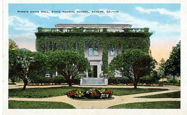
A 1910 postcard of Winnie Davis Hall, built in 1902 by the Daughters of the Confederacy to serve as a dormitory for daughters of Confederate soldiers.

a variety of roles including as a Confederate military school, as a Federal garrison, as a school for disabled young Confederate veterans, and as home to UGA's agriculture and mechanical arts programs. In 1891, the state established the Normal School to train rural teachers in teaching standards or "norms," and the nearby commercial area soon adopted the name "Normal Town." The oldest surviving buildings were built during this period, including Winnie Davis Hall, erected in 1902 as a memorial to the daughter of Jefferson Davis, and the Carnegie Library, built in 1910 with a grant from the Andrew Carnegie Foundation. In the 1930s, the campus served as home to UGA freshmen and sophomore women to keep them isolated from the temptations of the main campus and downtown. In 1953 the site was purchased by the U.S. Navy as a permanent location for its Supply Corps School. In 2011, ownership of the campus will once again return to the University of Georgia, which will develop it as a medical campus while preserving its historic buildings. Because of its historical and educational significance, it is listed on the National Register of Historic Places. This tour will last approximately 1½ to 2 hours.