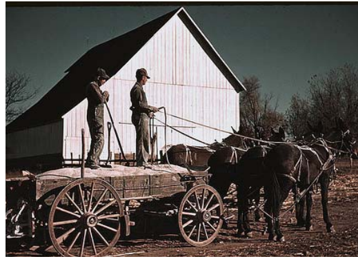
Mule team pulling wagon on farm in Southeast Georgia, c. 1940s.