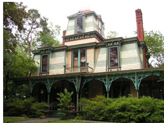
The Jester House on Cobb Street, one of the homes saved by the Historic Cobham Foundation.