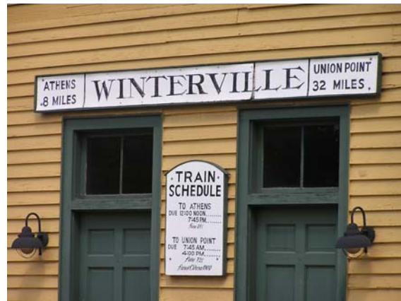
Winterville is one of the many towns in Georgia which owe their existence to the railroads, due to the need for steam trains to stop frequently for water (to be converted into steam) and fuel (first wood, later coal).

Incorporated in 1904, the City of Winterville is a circle, one-mile in radius, located entirely within Clarke County, but its 1,061 citizens are only a small part of the larger zip code known as Winterville which includes portions of three counties—Clarke, Oglethorpe, and Madison. The tour includes numerous and diverse historical structures such as the recently renovated train depot; the Carter-Coile Doctor’s Museum; a blacksmith shop; the old Winterville High School—home of the state’s first home economics program; and several period homes all located within an area included in the National Register of Historic Places. Tour goers will walk portions of the abandoned railroad designated to become “The Firefly”—a 38-mile walking and cycling trail extending from downtown Athens to Union Point. This tour will last approximately 1½ to 2 hours.