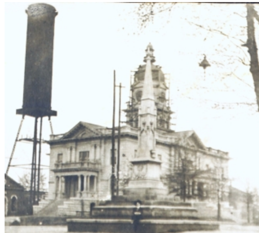
This image from a UGA student's scrapbook (1904-1908) shows City Hall still under construction with the Confederate Memorial in its original location at the corner of Washington and College.