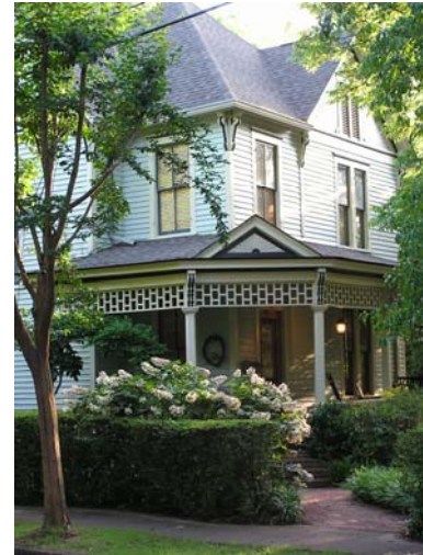
The Stovall home at 223 Boulevard, an 1899 Queen Anne Victorian.

In 1890, the newly founded Athens Park and Improvement Company bought 300 acres north of Prince and west of Barber Street and made an agreement with Athens's street railroad company to extend its tracks into their land, making an easy commute to downtown. Thus, Boulevard, the first "streetcar suburb" in Athens, was established. The Boulevard neighborhood became home to a diverse population that encompassed virtually all social classes and income levels. Boulevard forms the spine of the neighborhood and is characterized by wide lots and larger homes, mostly in the Queen Anne and Neoclassical styles. The north edge of the district was (and still is) bounded by railroad tracks, and a textile firm, the Southern Manufacturing Company, established itself along the tracks. The streets surrounding it were developed with mill houses for the company's workers. Like many of Athens historic in-town neighborhoods, neglect and development took its toll in the mid-20th century, and the neighborhood became largely rental. Luckily, Boulevard's faded grandeur, cheap rent, and proximity to downtown drew artists, musicians and writers, many of whom later purchased and rehabilitated its homes. The diversity which characterized Boulevard at its founding continues today, and eclectic and creative types abound. This tour will last approximately 2 hours.