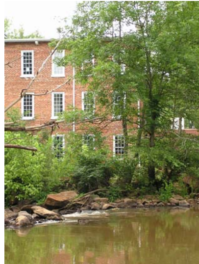
The “wool” building of the Athens Cotton and Wool Factory, which still has its original stone-walled millrace.